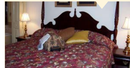
Guest Room Photos