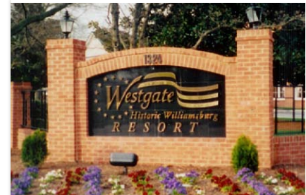
Resort Photos: Westgate Historic Williamsburg