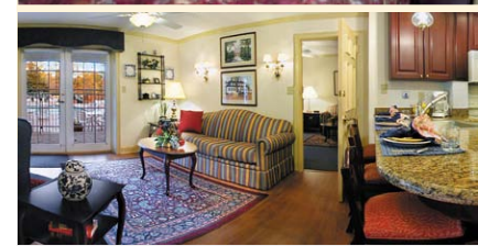
Amenities & Facilities